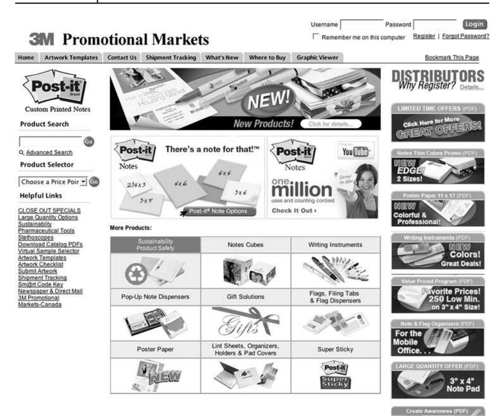
FIGURE 12.3 | 3M's Web Site Makes It Easy to Personalize Post-it Notes